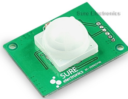
PIR sensor I had use in this project

PIR sensors allow you to sense motion, almost always used to detect whether a human has moved in or out of the sensors range. They are small, inexpensive, low-power, easy to use and don't wear out. For that reason they are commonly found in appliances and gadgets used in homes or businesses. PIRs are basically made of a pyroelectric sensor, which can detect levels of infrared radiation. Everything emits some low level radiation, and the hotter something is, the more radiation is emitted. The sensor in a motion detector is actually split in two halves. The reason for that is that we are looking to detect motion (change) not average IR levels. The two halves are wired up so that they cancel each other out. If one half sees more or less IR radiation than the other, the output will swing high or low.